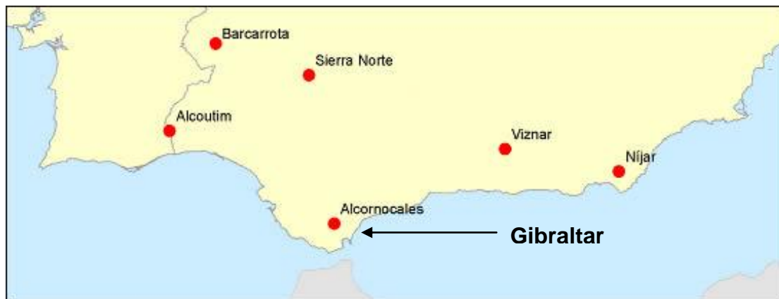
Figure 1 Spanish regional background sites used in analysis