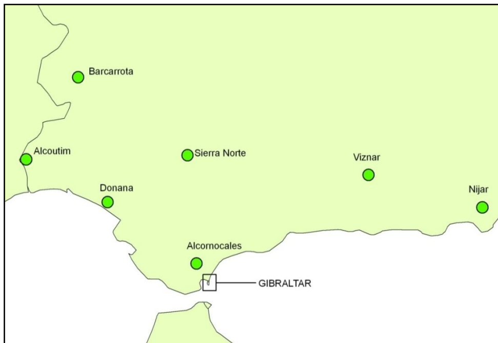
Figure 1: Spanish regional background stations used in the determination of African dust days.