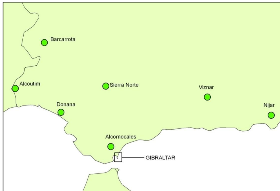
Figure 1: Spanish regional background stations used in the determination of African dust days.

Since 2009, the PM 10 mass concentration measurements from the regional background monitoring station at Alcornocales were made available by the Spanish Government for the purposes of quantifying the increase in the daily mean PM 10 mass concentration in Gibraltar due to African dust events. The regional background PM 10 monitoring station at Alcornocales is located significantly closer to Gibraltar than the other Spanish regional background monitoring stations shown in Figure 1. Given its proximity to Gibraltar, the African dust correction factor at the Alcornocales air quality monitoring station will be more representative of the situation in Gibraltar. For this reason Alcornocales continues to be used as the regional background monitoring station paired with the Gibraltar Air Quality Network stations in order to account for the impact of African dust.